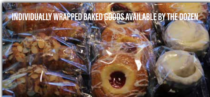
Butter Croissant, Almond Croissant, Fruit Danish, Cream Cheese Danish, Lemon Danish and More. Ask your Catering Specialist for Details.

(Potatoes May Be Substituted for Our Fresh Baked Brioche French Toast at no Cost)